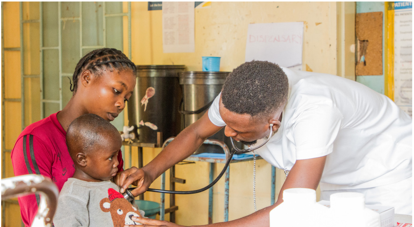
File picture of healthcare worker with Client at Chinyanta Rural Health Centre in Mwanabombwe District

E xpectant mothers at Kaundula Rural Health Centre in Luano District are happy with the installation of a 2kWp, 3kVA Power Solar System.