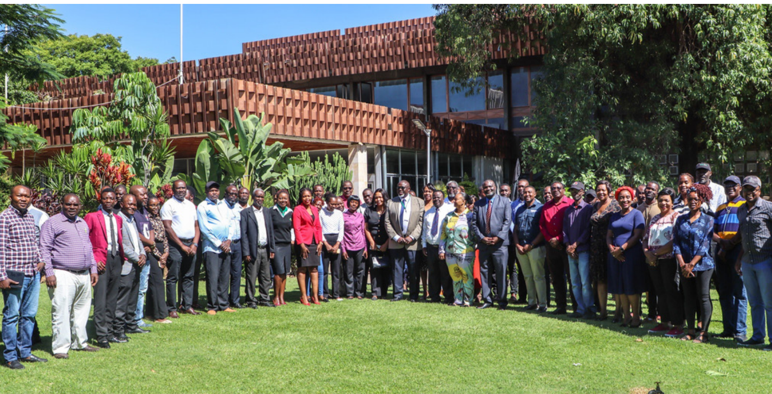
Contractors and Suppliers that attended the Training Workshop