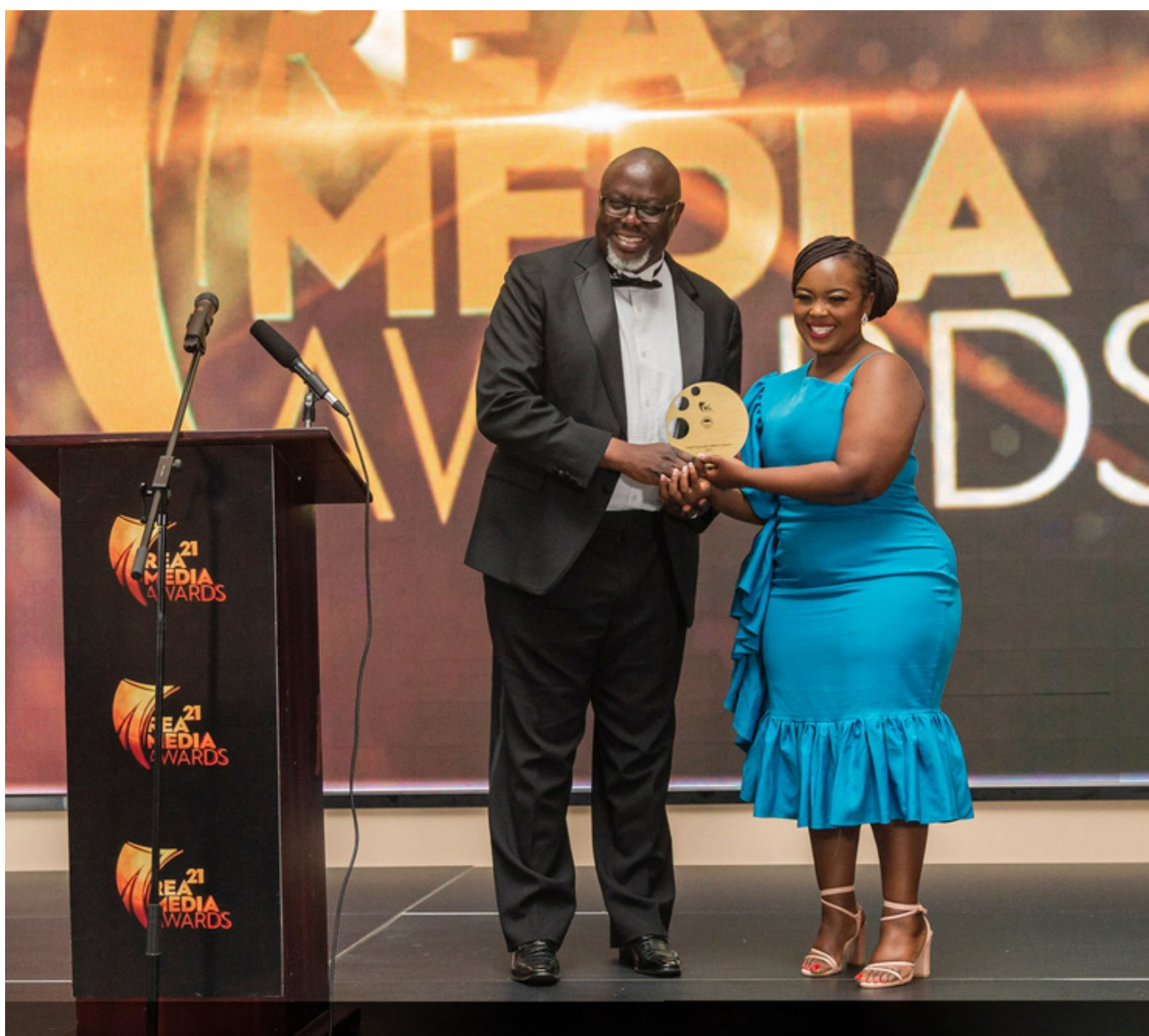
File Picture of 2021 REA Awards.

The Zambia Institute of Public Relations and Communication is the professional body which regulates public relations and communication in Zambia.