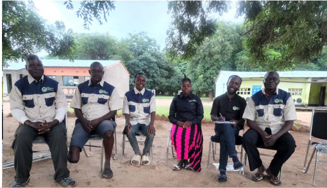
Community Project Committee members during a community sensitisation programme for Kamphambe grid development project in Katete district, Eastern province.

T he Rural Electrification Authority (REA) has announced its collaboration with the Ministry of Community Development and Social Welfare. This partnership aims to bolster community engagement and empowerment within REA project areas, fostering sustainable development and effective stakeholder satisfaction.