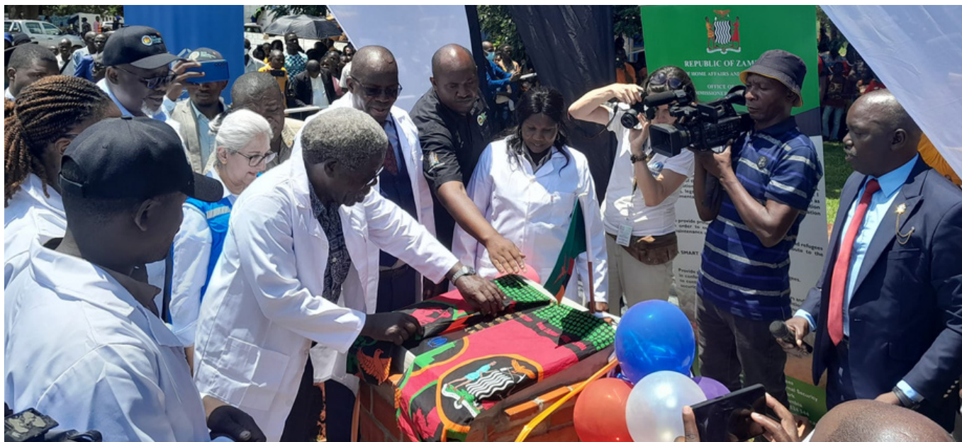
North Western province Permanent Secretary Col Grandson Katambi unveiling the plaque during ground breaking ceremony on behalf of Minister of Energy Hon. Peter C. Kapala MP.

The Government of the Republic of Zambia, through the Rural Electrification Authority (REA), working with the Office of the Commissioner for Refugees (COR) and United Nations High Commissioner for Refugees (UNHCR), jointly launched an electrification project in the Meheba Refugee Settlement of Kalumbila District in the Northwestern Province. The project is in line with the government's mission through the REA to electrify rural communities equitably and sustainably for positive socio-economic transformation.